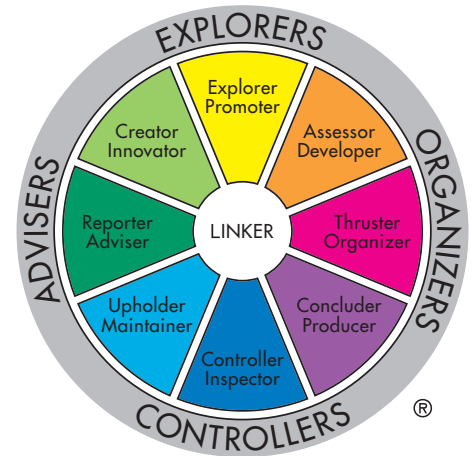
Margerison-McCann Team Management Wheel